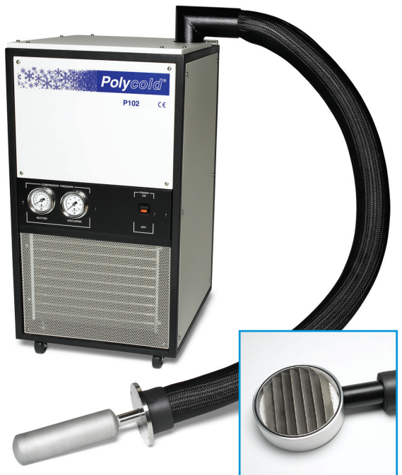
The P-102 with Cold Probe